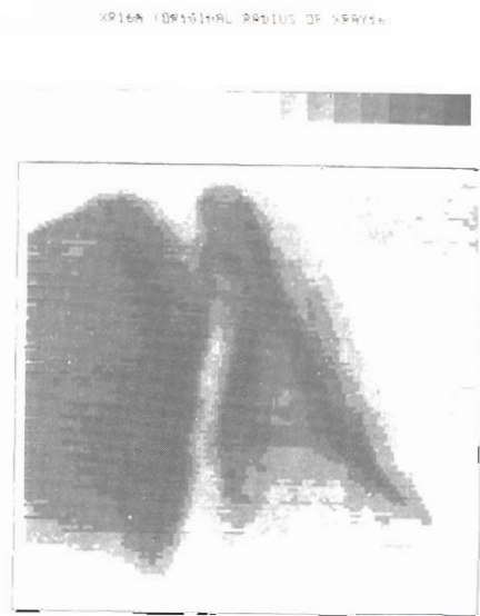
Figure 2 Input X-ray image

The slight modification of equation (14), given in equation (6), is found to reduce the number ( r ) of