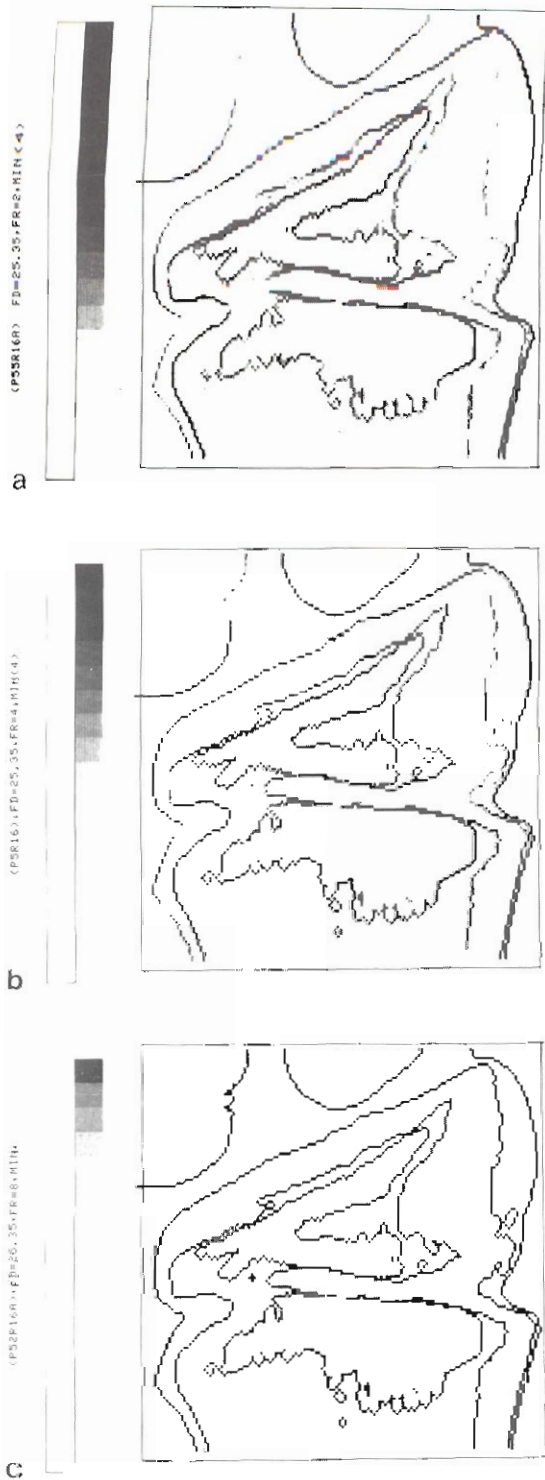
Figure 3 Edge detected output: (a) r=2 , (b) r=4 , (c) r=8 .