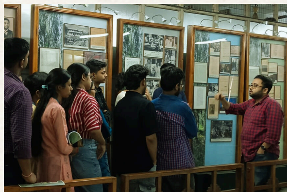
Students of St. Pauls Cathedral Mission College

Active participation & interest from the visitors across India & worldwide for PCMMM&A signifies the importance of Archives in contemporary academic & cultural discourse. PCMMM&A is dedicated to serving as an open and inclusive space for the researchers, scholars, students & general public to connect with the scientific heritage of India.