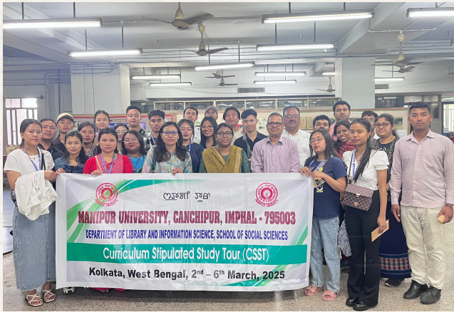
LIS Students of Manipur University