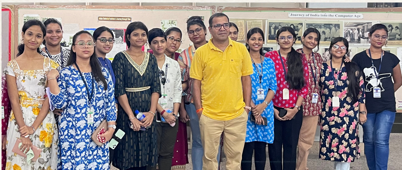
Students of Maharani Kasiswari College