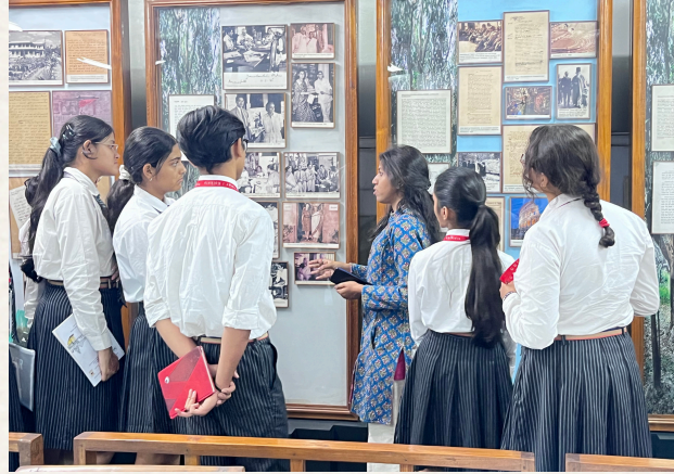
Students of G.D.Goenka School