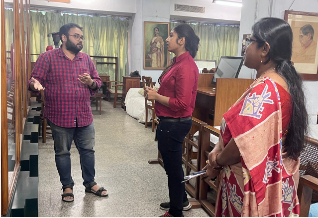
Akashvani (AIR) interview at PCMMM&A