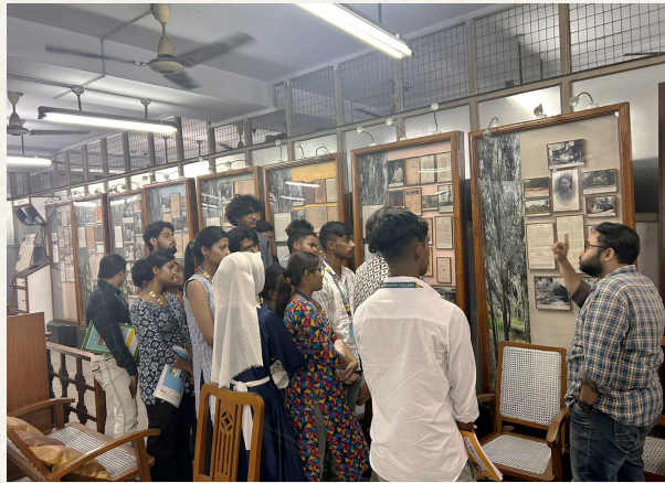
History (Major) Students of Surendranath College