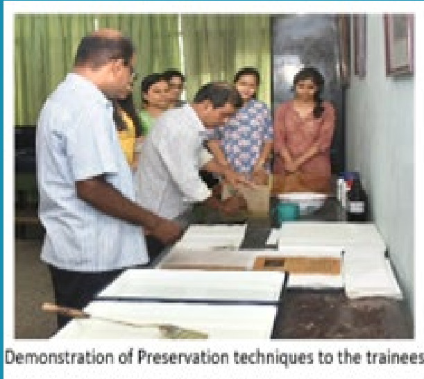
Demonstration of Preservation techniques to the trainees

Conservation and Documentation for the preservation of the collection to ensure availability to present and future researchers. During this financial year, approximately 2394 nos. of archival documents were provided preservation treatment after assessing their condition.