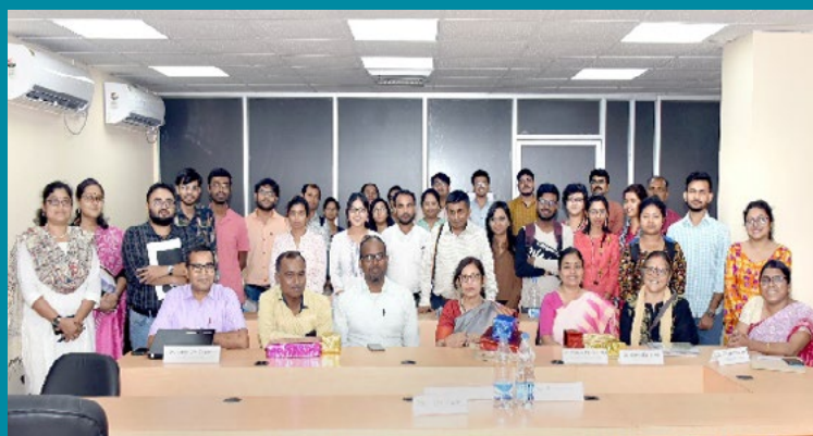
Photographs of the Seminar