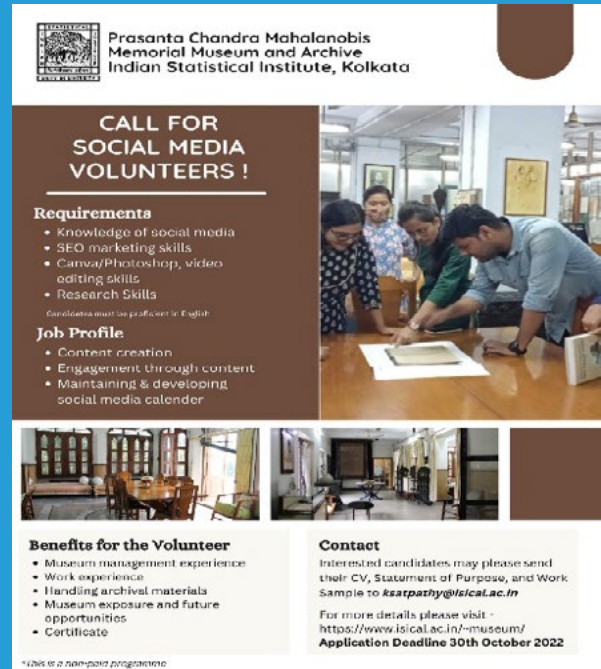
Poster of social media volunteer Program

Social Media Volunteer Programme for PCMMM&A