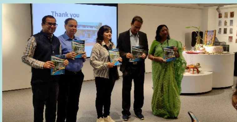
Book opening ceremony at KCC, Kolkata