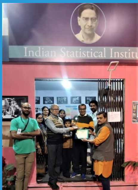
Special acknowledgement by Paschimbanga Bijan Mancha

4 Prasanta Chandra Mahalanobis Memorial Museum & Archives have jointly participated in Acharya Satyendra Nath Bose Bijan 'O' Prajukti Mela (Science & Technology Fair) with Research Scholars from Agricultural and Ecological Research Unit (AERU), ISI and Laboratory for Cognitive systems and Cybernetics Research, ISI from 19 th Jan 2023 to 23 rd Jan 2023 at Hedua Park.