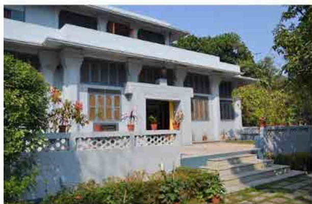
PCMMM&A Building (Amrapali)

In the year 1993 Prasanta Chandra Mahalanobis Memorial Museum & Archives (PCMMM&A) has started its journey as a museum and archive on the occasion of the birth centenary celebration of Professor Prasanta Chandra Mahalanobis (PCM). This museum and archives was established in the historic building Amrapali which was the residence of Prasanta Chandra Mahalanobis from 1941 and the nest or the nucleus of the Indian Statistical Institute Kolkata from its inception. Setting up a museum and archives for the systematic preservation of the documents related to the formulation and development period of this Institute was a dream project of Professor Prasanta Chandra Mahalanobis, but due to his sudden demise on 28th June 1972 the project was terminated. During 1991 the Institute took the initiative to establish a museum and archives to pay homage to the founder of the Indian Statistical Institute, Professor Prasanta Chandra Mahalanobis.