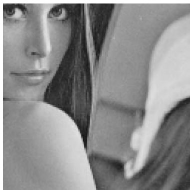
Figure 5: Two times magnified “Lena” using Nearest Neighbour