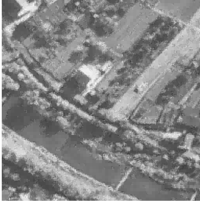
Figure 13: Four times magnified “LFA” Fractal technique

measure. We have used a very simple technique for the detection of edges though one may suggest more complex techniques for it.