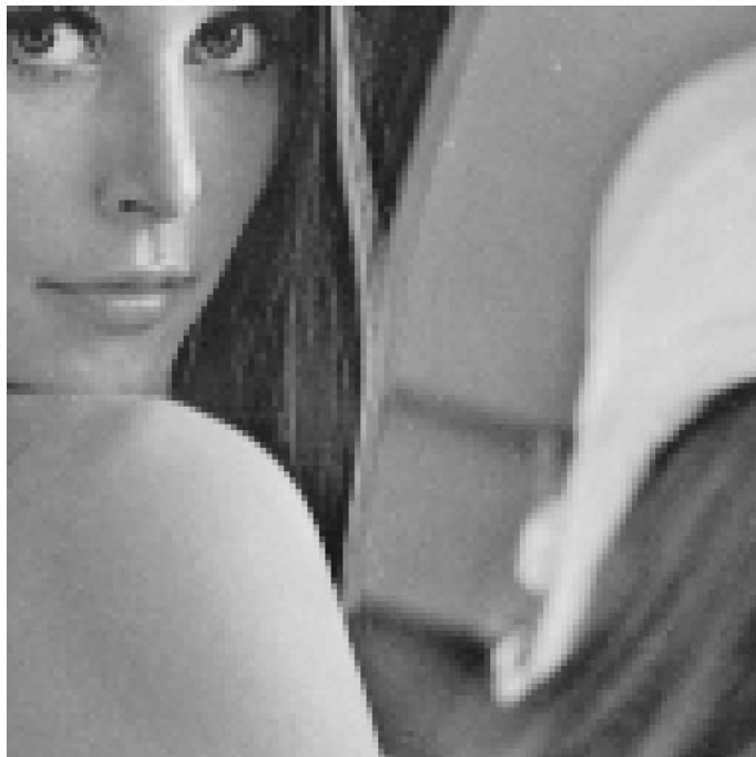
Figure 7: Four times magnified “Lena” using Nearest Neighbour