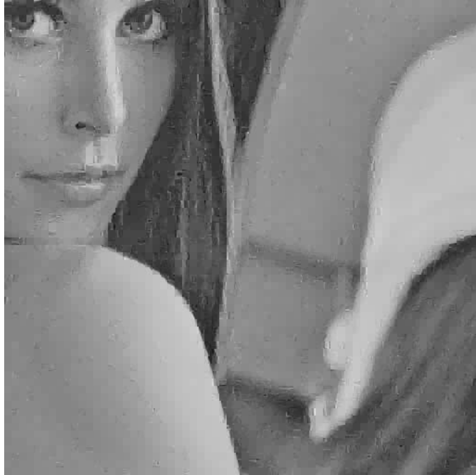
Figure 6: Four times magnified “Lena” Fractal technique