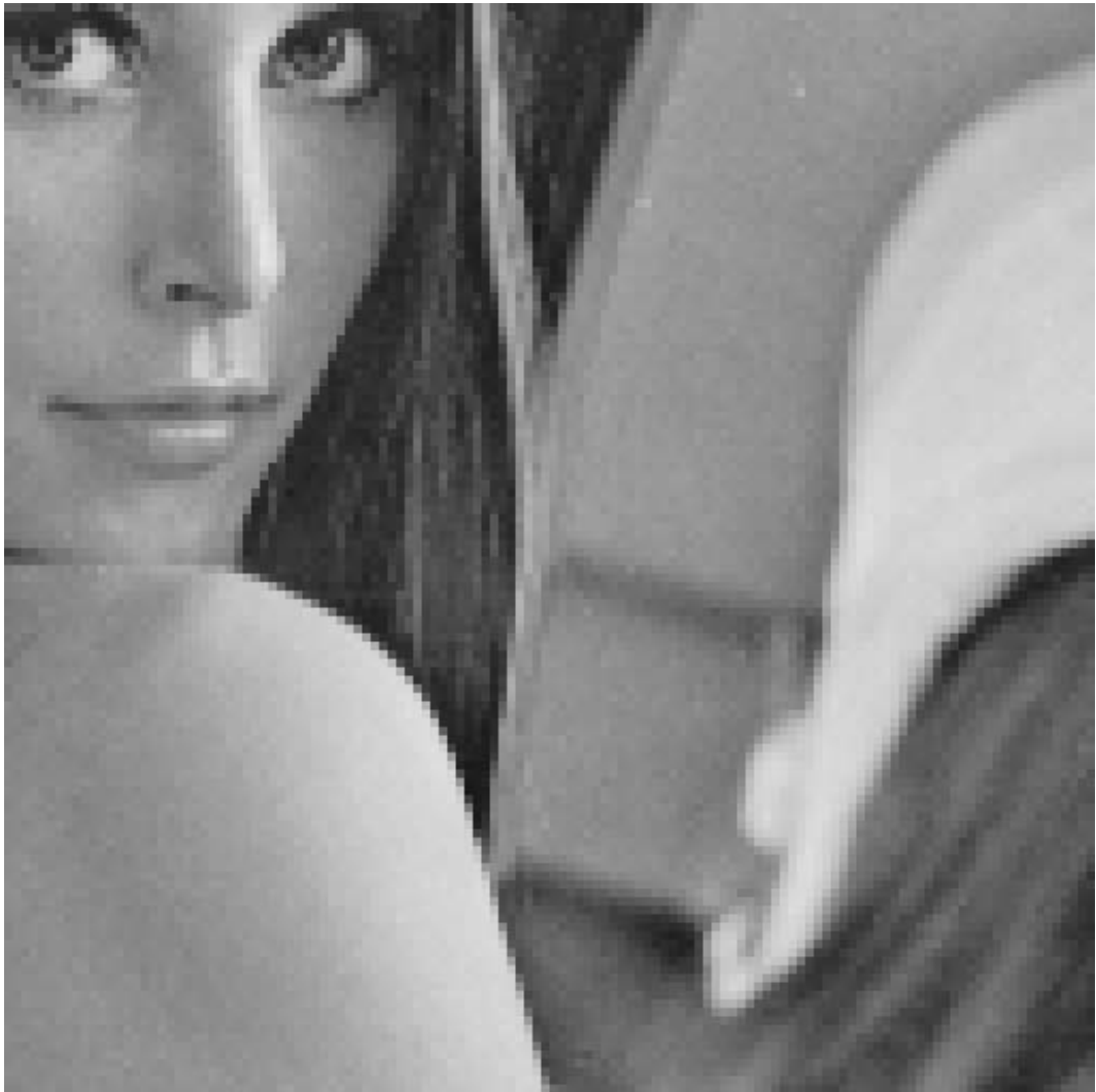
Figure 9: Eight times magnified “Lena” using Nearest Neighbour