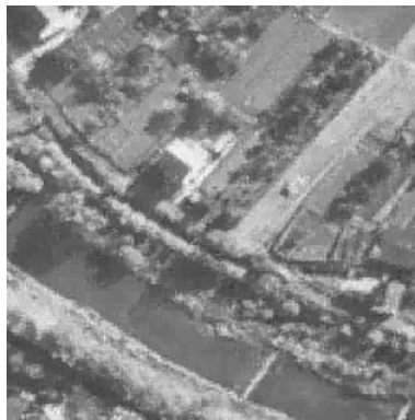
Figure 12: Two times magnified "LFA" using Fractal technique