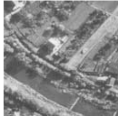
Figure 10: Original "LFA" image