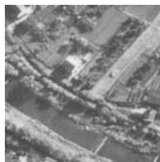
Figure 11: Decoded "LFA" image