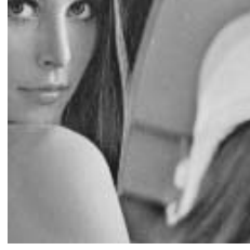
Figure 2: Original “Lena” image