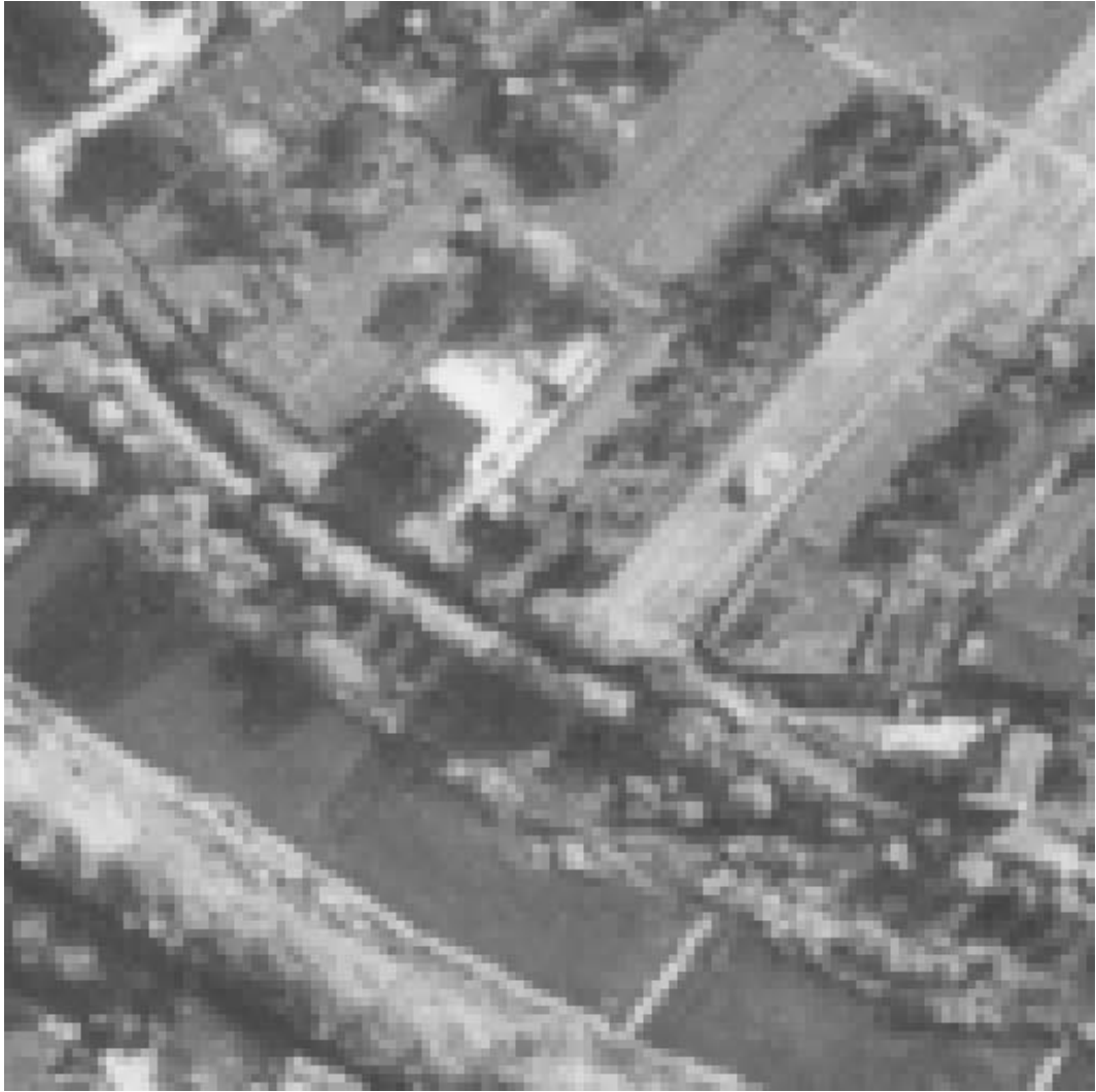
Figure 15: Eight times magnified “LFA” using Nearest Neighbour