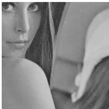
Figure 4: Two times magnified “Lena” using Fractal technique